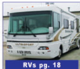
RVs pg. 18