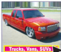
Trucks, Vans, SUVs